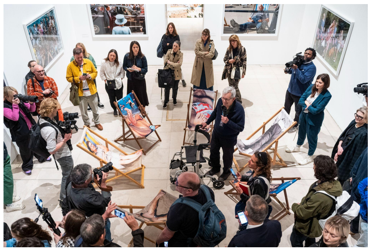
The 2023 Master of Photography, Martin Parr, at the press tour for his exhibition 'Martin Parr. Recent Works'.

Opening just days after the coronation, this year's Public Programme offered a timely celebration of the best of British photography. The legendary Martin Parr reigned supreme, with this year's Master of Photography hailed as 'the Godfather of contemporary British Photography' by fair Founders Benson and Farshad — an accolade much repeated across widespread media coverage.