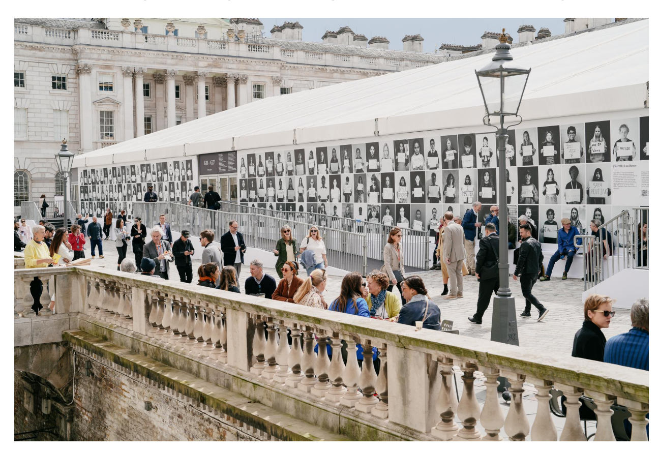
Visitors in front of 'I Matter' pavilion project at Photo London 2023.

Photo London Digital 10 May – 29 May 2023, artsy.net and photolondon.org