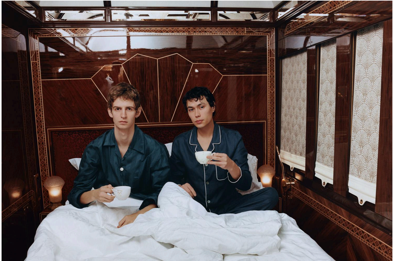
Coco Capitán, 'Coffee O'Clock', 2022.

Each of the three artists' expression and approach is unique, and the diversity of work reflects not only their singular lens, but their personal fascinations with travel and the Belmond destinations they document. These new commissions push us to collectively be open to the ever-evolving possibilities of artistic photography as a vehicle to share meaningful experiences of travel.