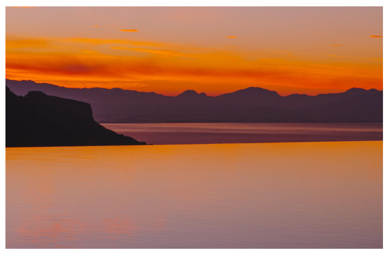
Letizia Le Fur, 'Caruso 015', 2022.

For further information about Photo London 2024 and to book tickets visit: <a href="https://photolondon.org/">https://photolondon.org/</a>.