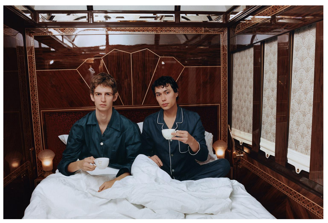
Coco Capitan, 'Coffee O'Clock', 2022.

Each of the three artists' expression and approach is unique, and the diversity of work reflects not only their singular lens, but their personal fascinations with travel and the Belmond destinations they document. These new commissions push us to collectively be open to the ever-evolving possibilities of artistic photography as a vehicle to share meaningful experiences of travel.