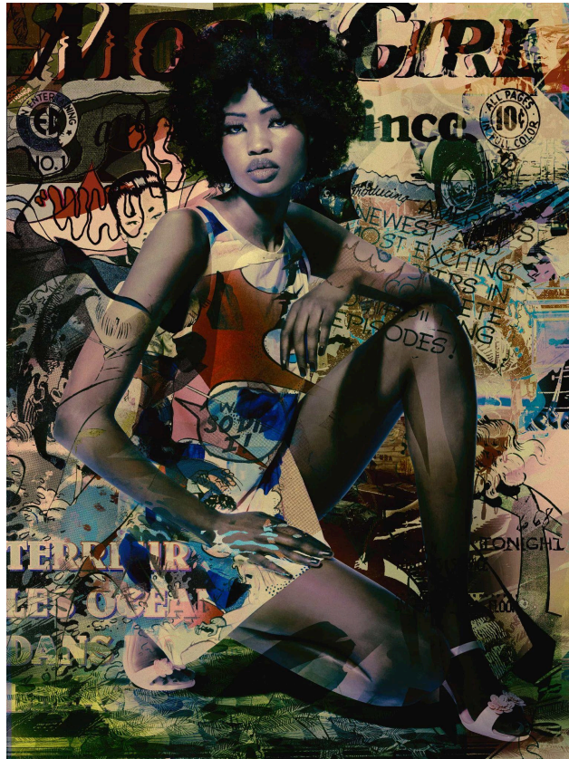
Valérie Belin, Galatée , 2023.

Photo London's Master of Photography for 2024 is one of France's most popular and acclaimed photographers, Valérie Belin. With the exhibition 'Silent Stories', Belin presents three decades of work, reflecting an iconography that is deliberately silent, through images that — in the words of their creator — "are neither narrative nor documentary and tell no particular stories, but are designed to be seen as the mirror of fictions without words."