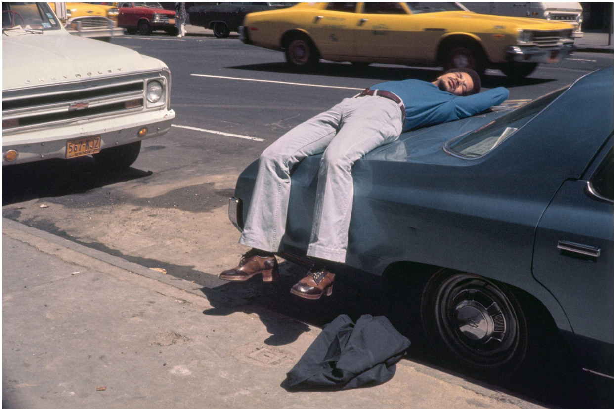
Helen Levitt, New York, 1974.

'That feeling has been echoed at the special collector cultivation events we have held in New York, Paris, Stockholm, Istanbul, Zurich and, of course, in London, where the prevailing opinion has been that Photo London is back to pre-pandemic levels. A nice result of this is that we are now looking forward to welcoming many new collectors to the ninth edition of the Fair. We are firmly convinced that Photo London 2024 will be a perfect foundation for the spectacular celebration of photography that will mark our tenth edition next year.'