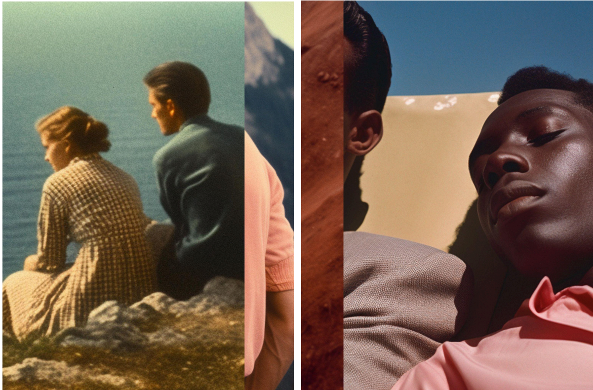
Images by Photo London x Nikon Emerging Photographer shortlisted artist Sander Coers. From the series POST , 2023, courtesy of the artist and Open Doors Gallery

"We are particularly thrilled that each of our Partners has enriched the Fair through their determination to engage with artists in a variety of highly creative ways. Several important collectors have also been willing to back emerging and experimental talents in Discovery and elsewhere. TurkishBank UK's support for our Turkish galleries; Belmond's support for contemporary photography and Pictet's commitment to photography have all played an important part in creating the Fair's unique DNA. Not only this, but each of them has worked hard to engage their networks and bring an important group of collectors to this year's Fair. It is my mission to make more contemporary art collectors into lens-based collectors and broaden the scope seen at the fair, therefore don't be surprised to see some sculptural photography, AI and other art forms. At Photo London, we embrace the breadth and diversity of photography, delving into new realms of creativity and innovation as we celebrate the past, present and future of the medium. Our aspiration is to be a fair that is as thought-provoking as it is beautiful, and that is engaging to all."